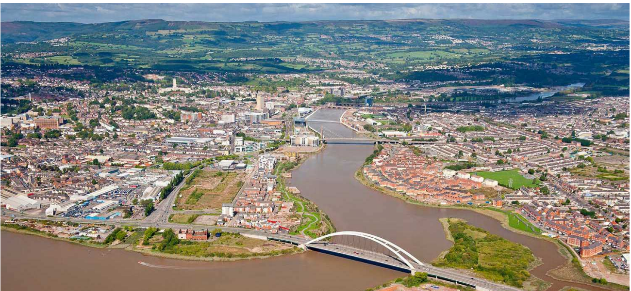
Newport's river corridor (River Usk)