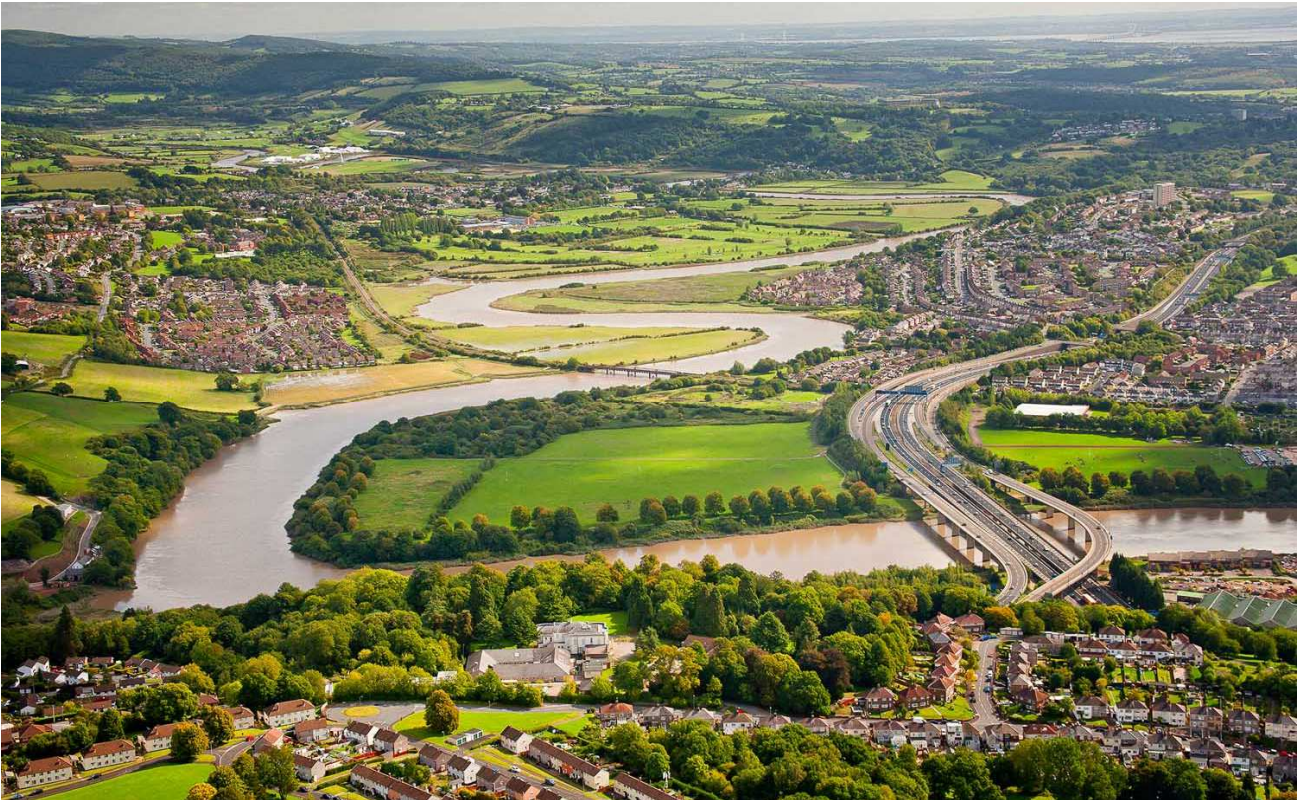
Looking up the Usk Valley from Newport.