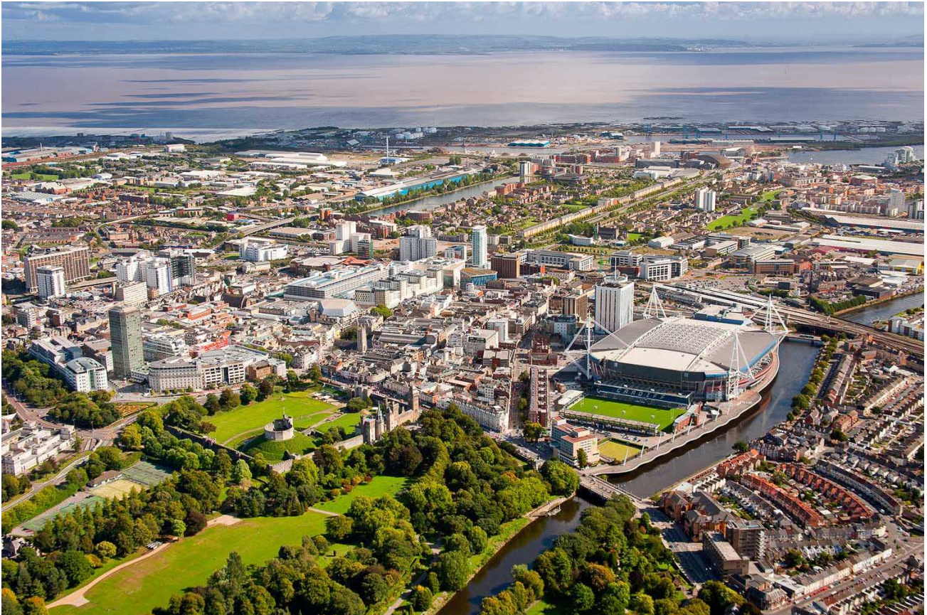
Cardiff, Wales's largest city and principle administrative centre for Wales, showing the city centre areas, the castle and it's parklands, the River Taff, Millennium Stadium and Severn Estuary in the background.

The open rural land between the urban areas is under pressure but is surprisingly tranquil in parts away from the transport corridors. It provides a welcome relief from the bustle of a dynamic part of Wales.