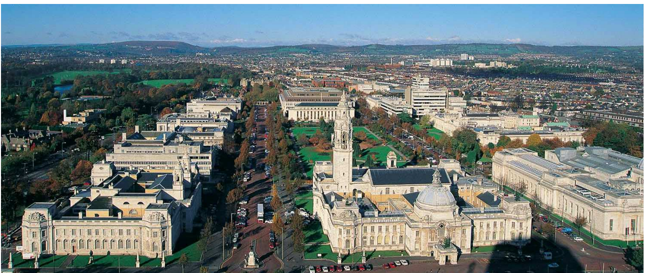
Cardiff – the old civic quarter, with wide planned layouts well-dressed stone buildings. A wider suburban area extends beyond.