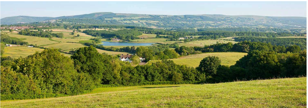
'Little Switzerland' from the Ridgeway view point. This appealing countryside forms the setting to Newport, with the rising uplands of the South Wales Valleys character area in the distance to the north-west, showing the hill of Twmbarlwm.