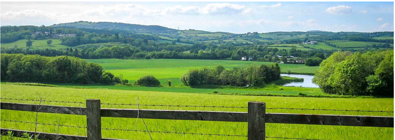
The rural landscape between Cardiff and Newport at Lower Machen, showing the Rhymney River.