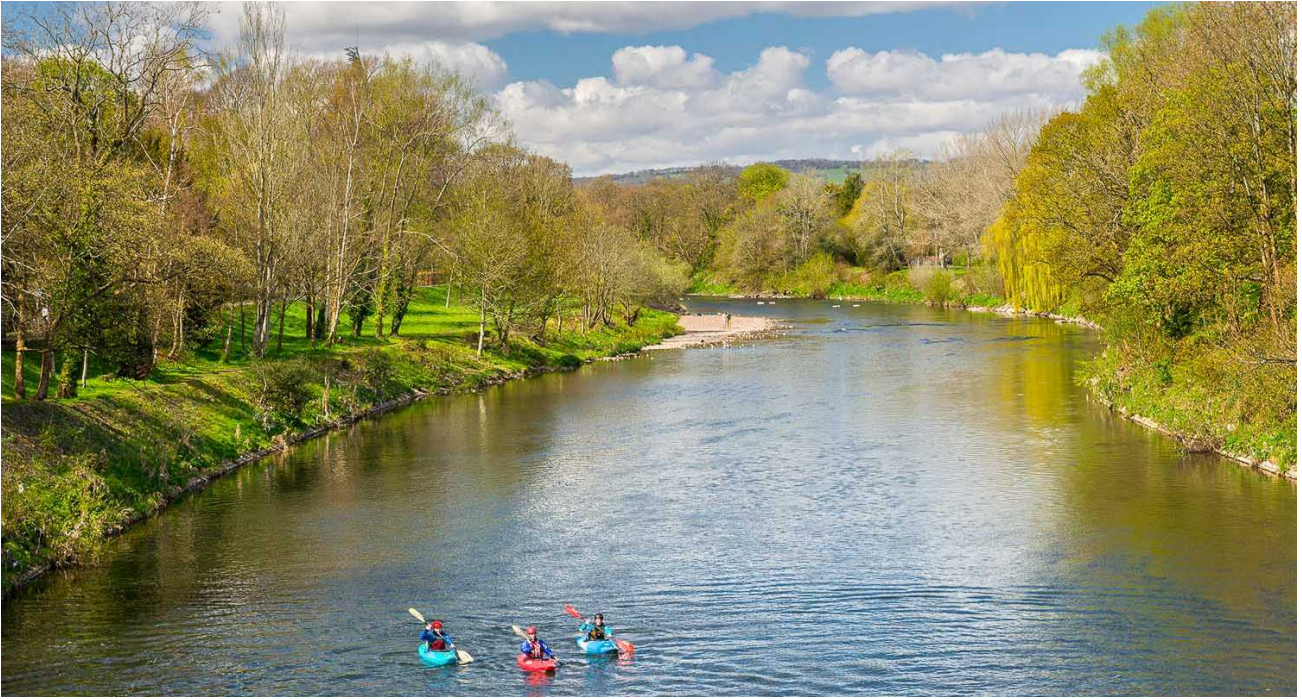
River Taff, a green, river corridor, running through Cardiff.