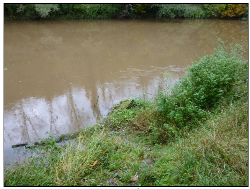
Figure 3 – Site 3