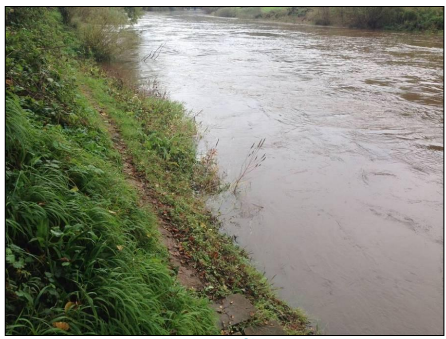
Figure 11 - Site 11