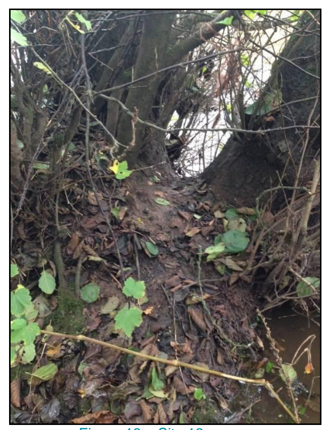
Figure 13 – Site 13

Sample date: 18/10/2014 Normandia nitens Stictotarsus duodecimpunctatus Nebrioporus elegans Gyrinus urinator