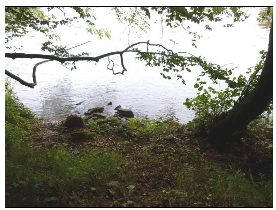
Figure 6 - Site 6