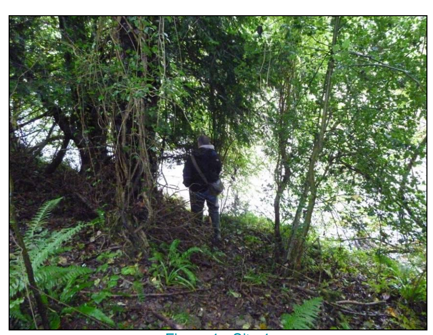
Figure 1 - Site 1

Sample date: 15/10/2014 Normandia nitens Macronychus quadrituberculatus Brychius elevatus Oulimnius tuberculatus Limnius volckmari Nebrioporus elegans