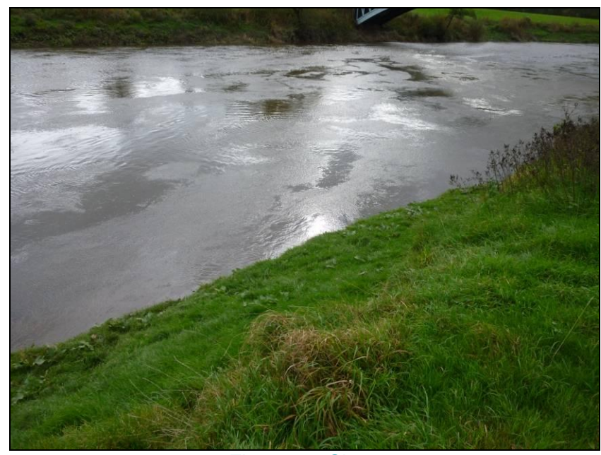
Figure 7 – Site 7