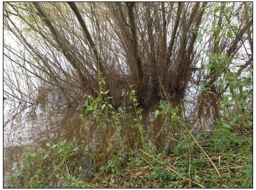
Figure 16 – Site 16

Sample date: 19/10/2014 Helophorous brevipalpis Oulimnius tuberculatus Gyrinus urinator