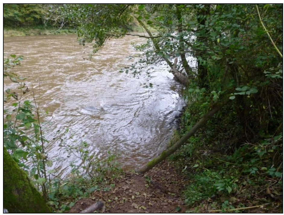
Figure 10 – Site 10