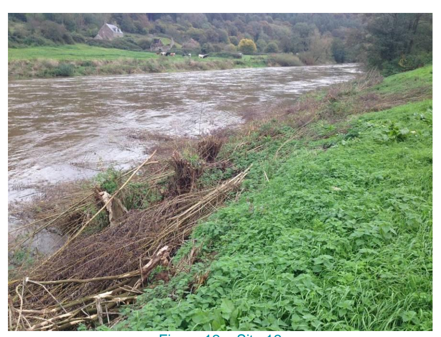
Figure 12 – Site 12

Site 12 is an open, unshaded site. A farm lies close to the site. Many coppiced willows occur on the banks and their roots are within the water. Himalayan Balsam also occurs on the banks. Both the main channel and the sample station is fast-flowing. No aquatic Coleoptera were netted from this site.