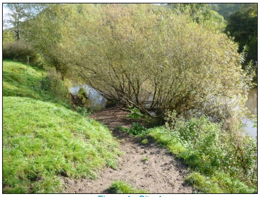
Figure 4 - Site 4

Sample date: 16/10/2014 Stictotarsus duodecimpunctatus Nebrioporus elegans Oulimnius tuberculatus