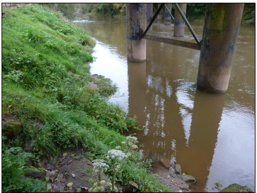
Figure 9 – Site 9

Sample date: 17/10/2014 Stictotarsus duodecimpunctatus Nebrioporus elegans Oreodytes septentrionalis Oulimnius tuberculatus