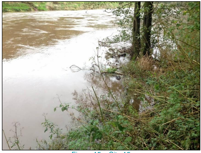
Figure 15 – Site 15

Sample date: 19/10/2014 Stictotarsus duodecimpunctatus Oulimnius tuberculatus Gyrinus urinator