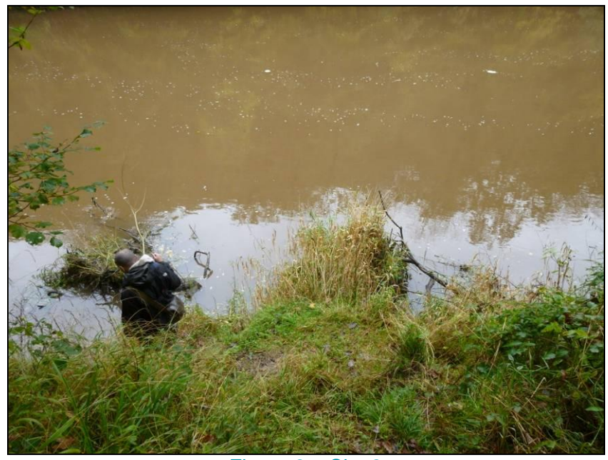
Figure 2 - Site 2

Sample date: 15/10/2014 Normandia nitens Stictotarsus duodecimpunctatus Limnius volckmari Nebrioporus elegans