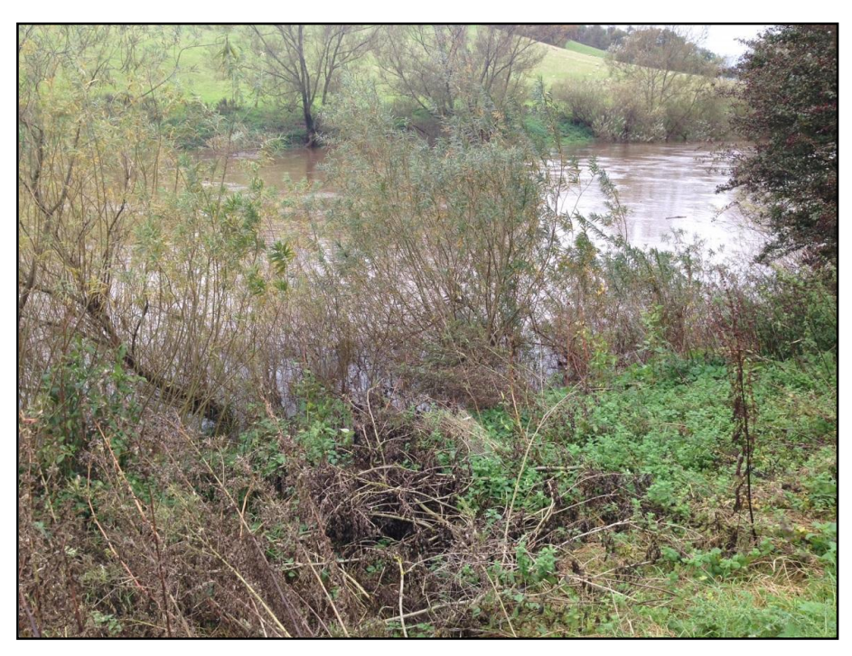
Figure 14 – Site 14