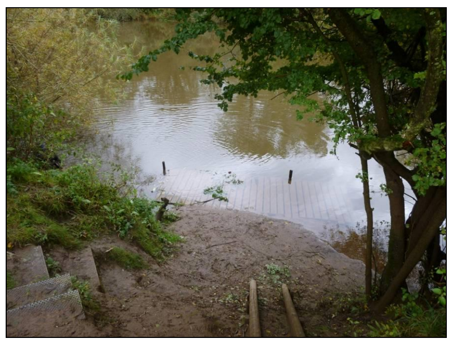
Figure 5 - Site 5

Sample date: 16/10/2014 Stictotarsus duodecimpunctatus Limnius volckmari Oulimnius tuberculatus