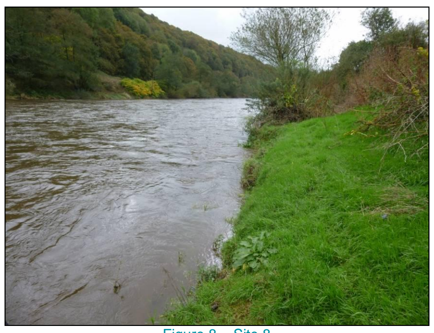
Figure 8 – Site 8

Sample date: 17/10/2014 Stictotarsus duodecimpunctatus