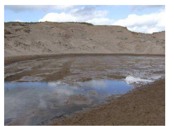
Photo 9: A view of Excavated Slack 1 in May 2013. In the foreground to the right is the small 'island' of slack habitat left by the excavations. This 'island' can be seen in Figure 1 and Photo 4. E1S1 was near the edge of the water, bottom right. The trapping site E1D2 was about half way up the dune face in the background.