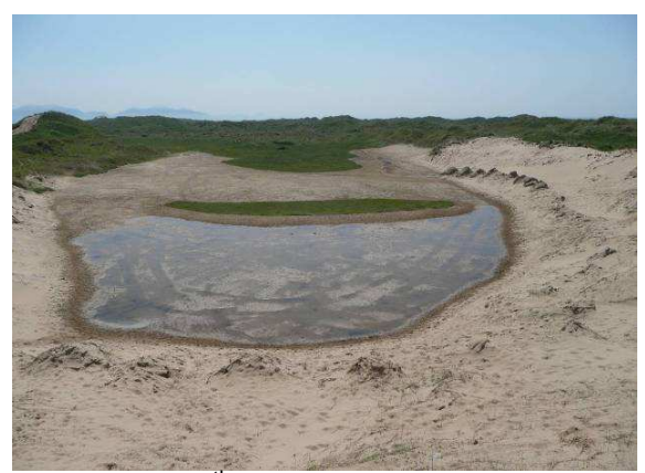
Photo 3: E1 8<sup>th</sup> June 2013. Note that the slack is still shallowly flooded. The small piles of sand around the edge of the slack have been eroded by wind – cp. Photo 2. Note also the extensive sand churning by ponies in foreground, on the dunes to the right and at the edge of the open water in the slack. The photo is taken approximately from the position of trapping site E1D2.