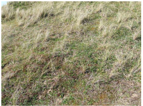
Photo 7: Habitat near trapping site CD2. Dunes at the head of the slack.