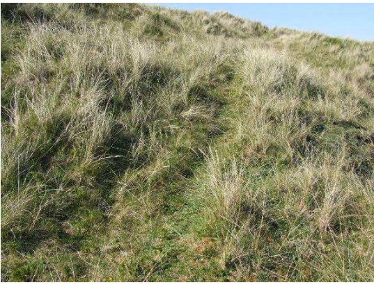
Photo 6: Habitat in the vicinity of trapping site CD1 (dunes on the northern edge of the Control Slack).