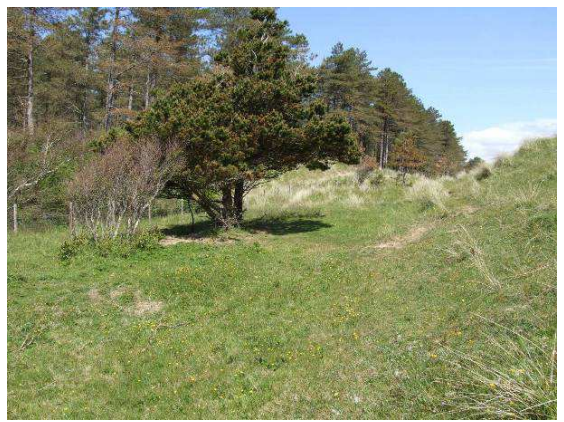
Photo 14: Corsican Pine and Sallow used for shade and rubbing. The Sallow is almost dead. Although this photograph was taken near the forest edge, there are similar examples in the middle of the dunes.