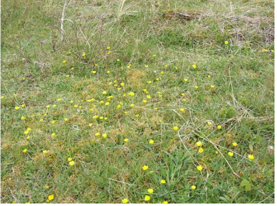
Photo 20: Bulbous Buttercup. This species is very abundant over large areas of the dunes.