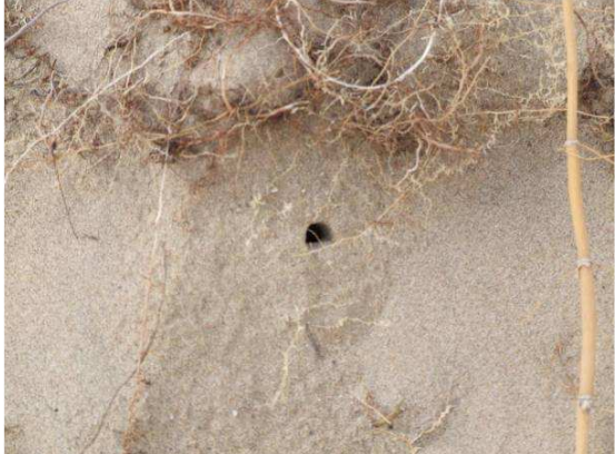
Photo 10: Characteristic burrow of Colletes cunicularius near trapping site ED2, 22<sup>nd</sup> May 2013. Note exposed roots of Marram Grass.