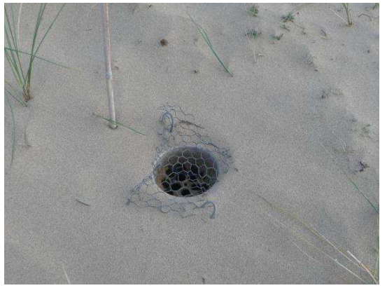
Photo 5: View of pitfall trap on excavated dune (E2D3) September 2013. Note some sand around edge of the filter. Also note the regenerating Marram Grass.