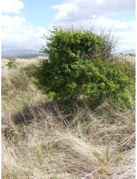
Photo 13: Small Hawthorn Tree that held a Carrion Crow's nest (Photo 12).