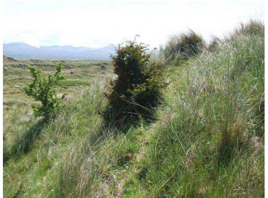
Photo 15: A Yew (middle) and Hawthorn on perhaps the highest dune on the NNR.