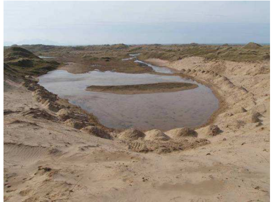
Photo 2: Slack E1 21<sup>st</sup> March 2013. Note the 'island' of slack vegetation remaining in the middle ground, retained for its bryological interest and to act as a spore reservoir for the excavated areas. Site E1S1 had to be placed just in front of this 'island' but, as the slack dried out, was moved closer to the camera position.