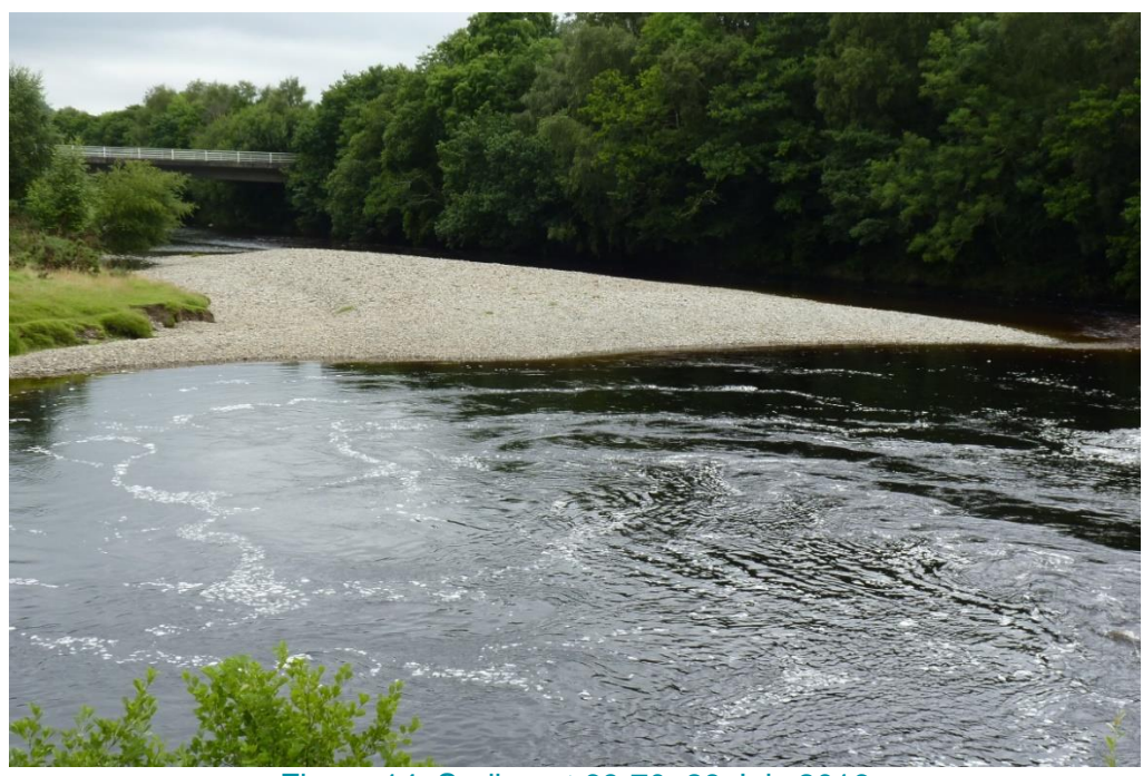
Figure 14. Sediment 69-70, 29 July 2016