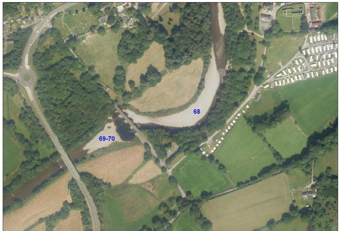
Figure 1. Location of shingle bars at Llanelltyd

The Afon Mawddach is a 23km unregulated river which rises in the southern part of the Arenig mountains and heads in a mostly westerly direction to Cardigan Bay at Barmouth. In the 1948, the river supported 36 shingle bars and an ERS area of 57,440m² which by 1992 had reduced to 25 bars and 35,818m², a reduction of 38% of its area (Brewer et al., 2006), principally attributed to the increase in the amount of vegetation on active and formerly active bar surfaces. The key shingle bar in 1948 was at Llanelltyd (Tan Lan: Sediment 68 in Figure 1) which measured 17,339m² and represented 30% of the total ERS resource; by 1992, this had reduced to 5,679m² and 16% of the resource but it remains an important resource.