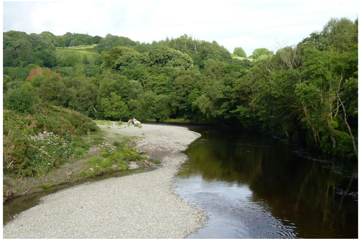
Figure 10. Sediment 68 on 29 July 2016