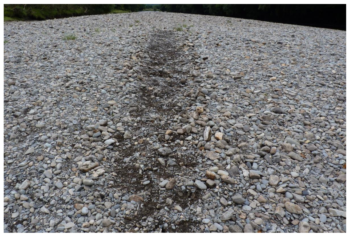
Figure 5. Hand-searching transect on Sediment 69-70

More time was spent hand searching on the upstream bar during the visit of 7 September 2016. Thirty minutes were spent investigating the shallow backwater (which was much reduced in size from the previous visit), twenty minutes were spent searching amongst the strandline in mid-bar (Figure 6), and a further thirty minutes were spent turning stones to look for invertebrates on the upper (dry zone) part of the bar.