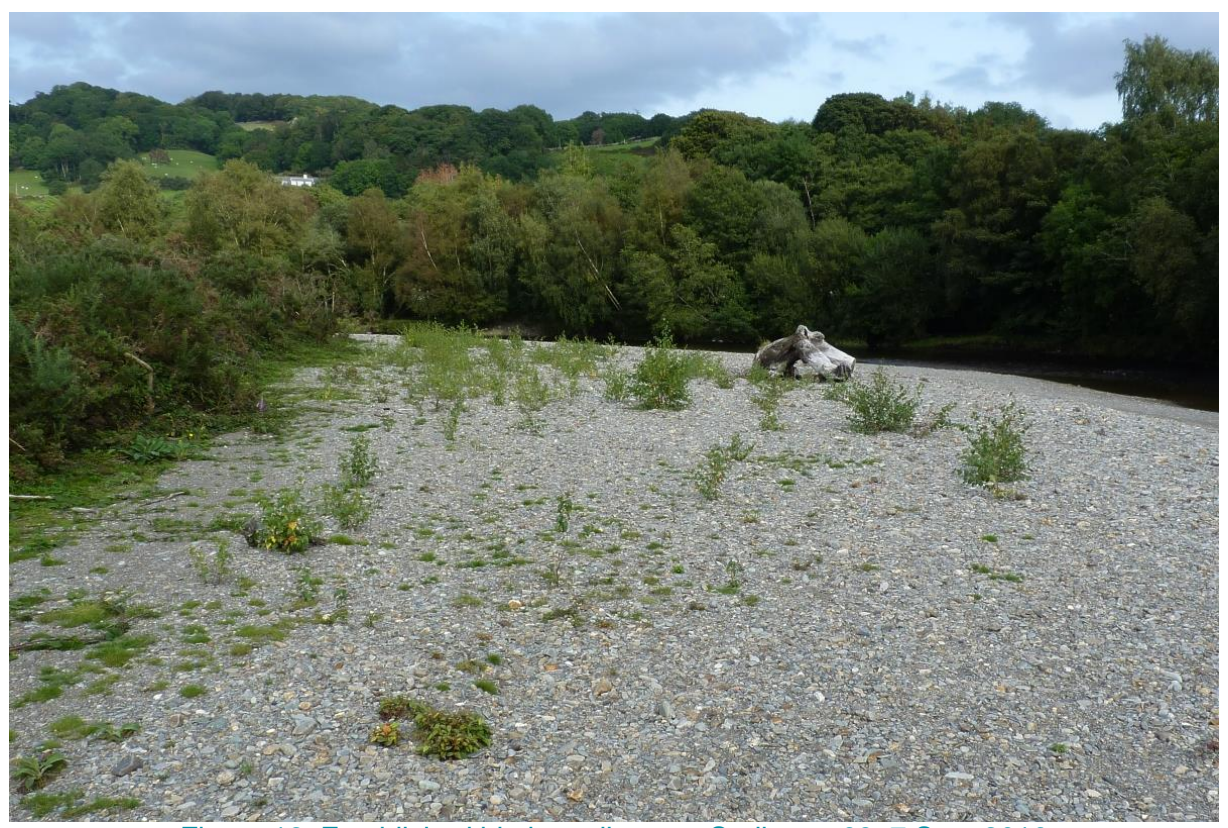
Figure 12. Established birch saplings on Sediment 68, 7 Sept 2016

zone near the water's edge where ERS invertebrates can burrow, find prey, and develop through their larval stages in permanently damp fine gravel. Above this zone the sediments will dry out to an increasing depth and, whilst surface active species will not be affected, subterranean species will not be able to thrive.