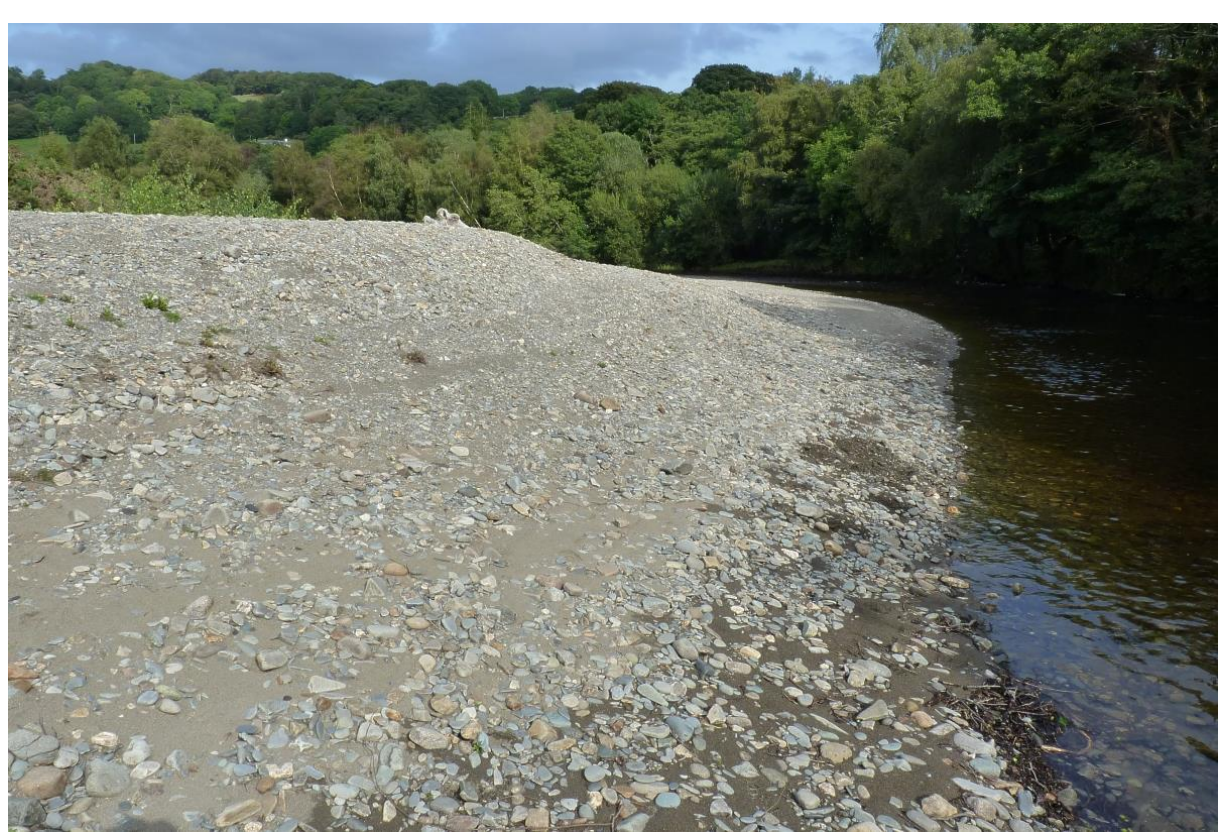
Figure 11. Steep profile to upper dome of Sediment 68, 7 Sept 2016

Figure 11 shows how steep the bank profile now is, rising quickly some two-three metres above the river level at low flow. The effect of this is to considerably limit the