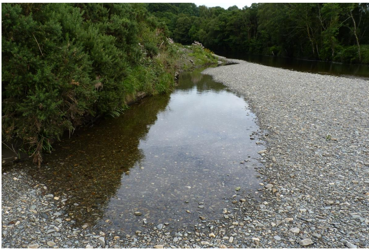
Figure 8. Backwater pool on Sediment 68 in July 2016

The most striking discovery of the 2003 survey was a single dead adult of the BAP Priority water beetle Bidessus minutissimus in an excavation on 15 July. This was the first record of this rare species from the Mawddach catchment. Bidessus is known to inhabit gravel-bed rivers, where it can occur in mid-channel but is most readily found in shallow temporary pools on shingle bars (Lott 2004, Foster 2010). The origin of the dead individual is unknown but it was suspected (Bell & Sadler 2003) that Bidessus may be breeding in the pools and backwaters on sediment 68. A total of 70 minutes was spent examining the pools at Llanelltyd over the three survey dates in 2016 but no evidence of Bidessus could be found. The backwater on Sediment 68 had abundant adults of the water beetle Oreodytes septentrionale and a few individuals of the related species, O. sanmarkii . Both species are characteristic of gravel-bed rivers in northern and western Britain. Further surveys of these pools would be worthwhile earlier in the season, but for now the mystery of where Bidessus is breeding on the Mawddach remains unresolved.