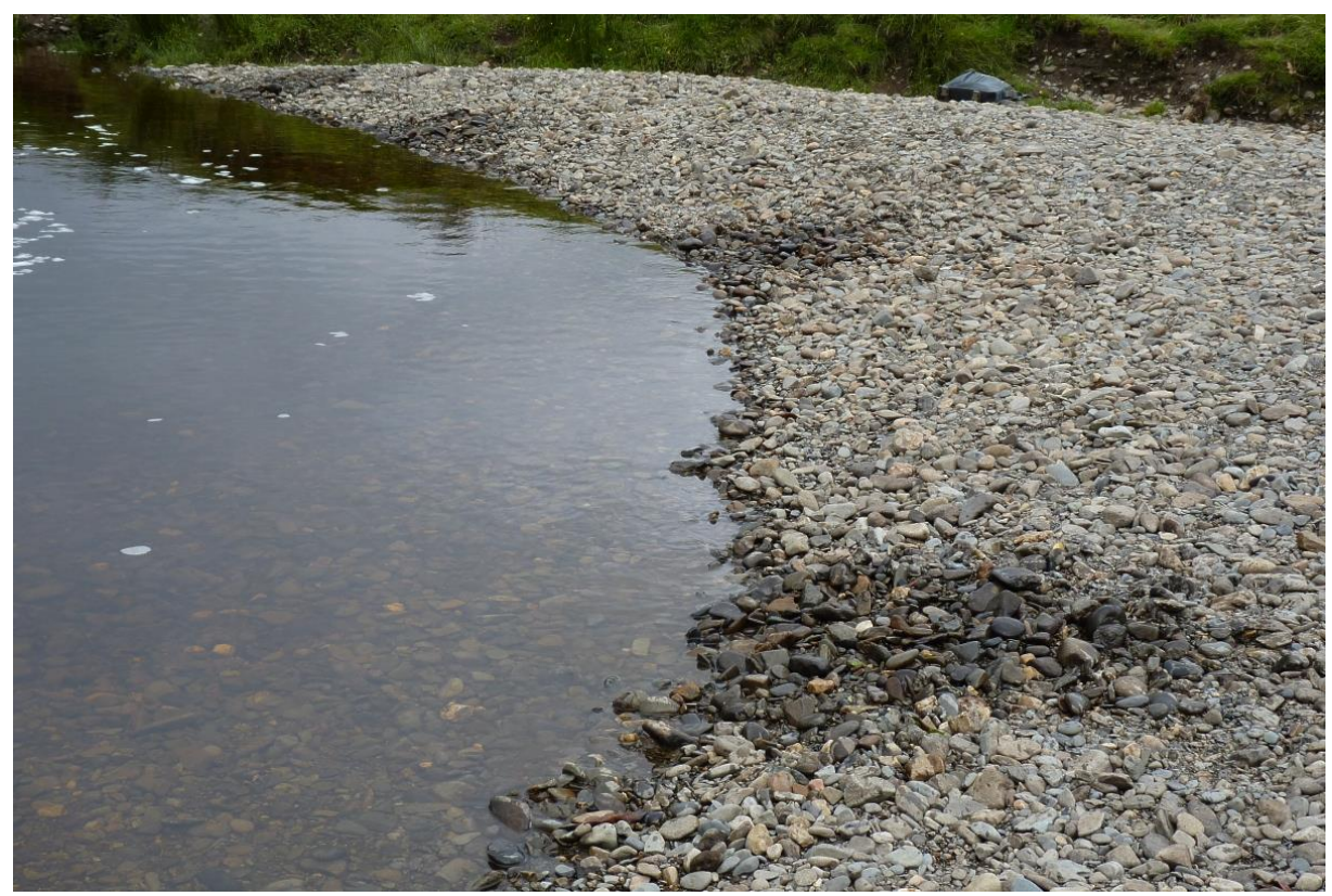
Figure 3. Example of kick samples on Sediment 69-70