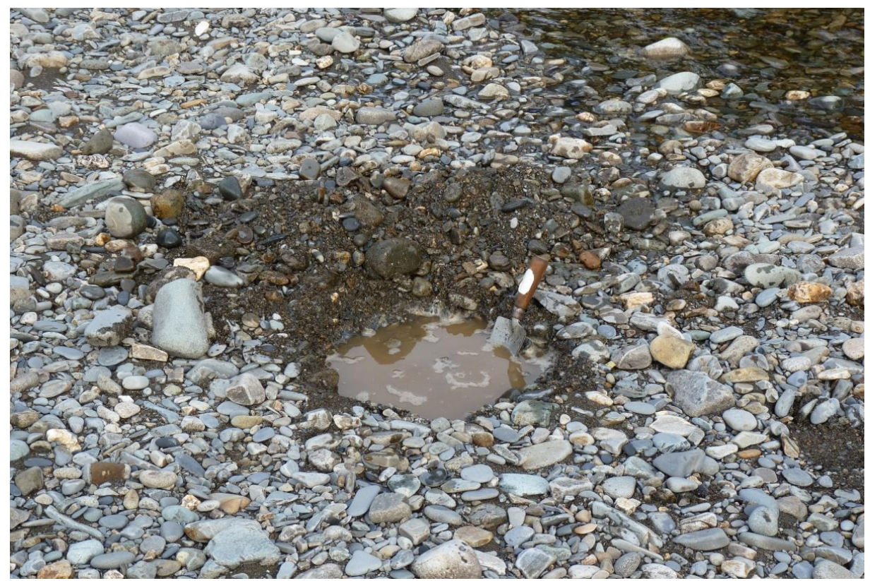
Figure 4. Example of excavation on Sediment 68