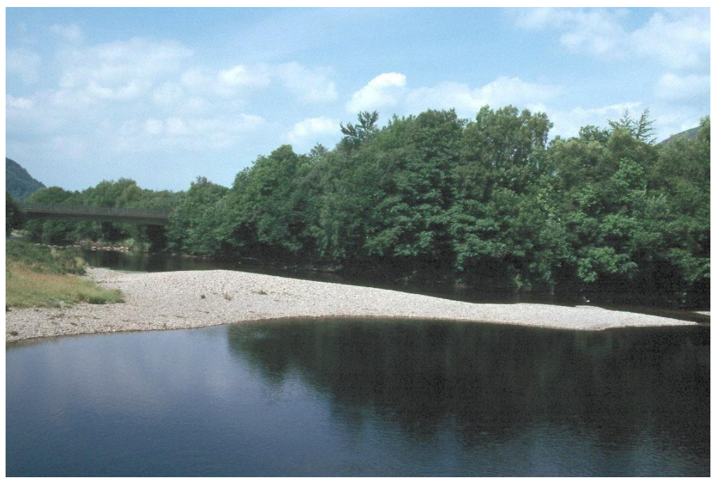
Figure 13. Sediment 69-70, 15 July 2003

As with Tan-lan, superficially the bar downstream of the old bridge looks much the same as it did in 2003 (Figure 13). The dome is slightly taller and the river has cut an earth clifflet in the left bank, where previously the grassland of the adjacent pasture spread out onto the shingle in a gentle slope. The bar is still poorly-sorted, with large cobbles forming the armour layer over much of its surface and few patches where fine gravels predominate in the matrix.