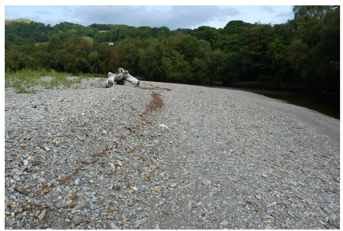
Figure 6. Strandline left by flood on 3 September 2016 (four days before sampling).

More time was spent hand searching on the upstream bar during the visit of 7 September 2016. Thirty minutes were spent investigating the shallow backwater (which was much reduced in size from the previous visit), twenty minutes were spent searching amongst the strandline in mid-bar (Figure 6), and a further thirty minutes were spent turning stones to look for invertebrates on the upper (dry zone) part of the bar.