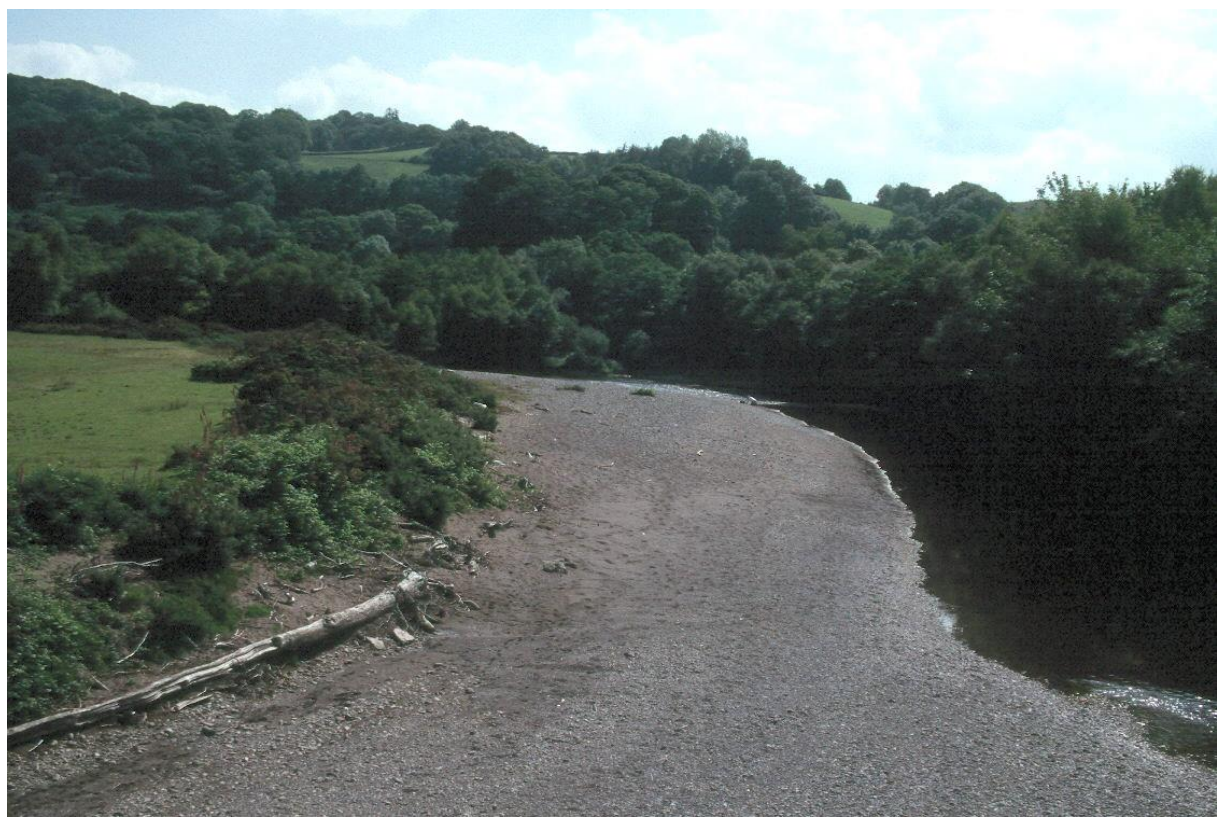
Figure 9. Sediment 68 on 15 July 2003

The approximate distribution of sediment types on Tan-lan is shown in Figure 2, characteristically with larger cobbles and a few boulders at the head of the bar and fine gravels and sands at the toe. In many respects this is a perfect example of a point bar on Welsh gravel-bed rivers, but there does seem to have been a noticeable change in recent years. Back in 2003, at the time of Sadler & Bell's survey, the bar looked superficially similar to today (Figure 9) but there are slight differences which may limit the significance of the bar for ERS invertebrates.