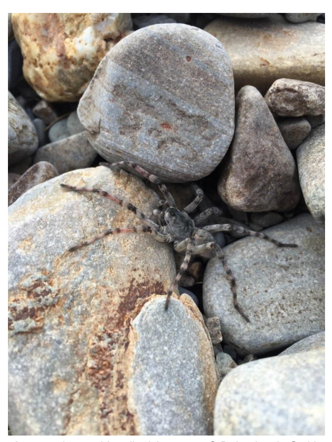
Arctosa cinerea, Llanelltyd Aug 2016 © Deion Lewis-Smith