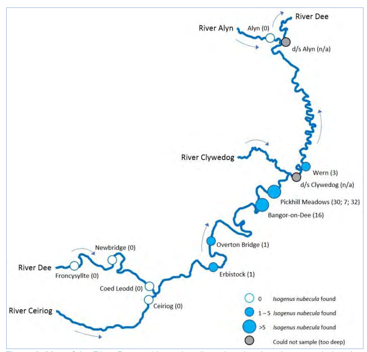
Figure 3. Map of the River Dee and its major tributaries showing sites sampled and where Isogenus nubecula was found in in spring 2018. Number found in parentheses (Pickhill Meadows had three site visits).