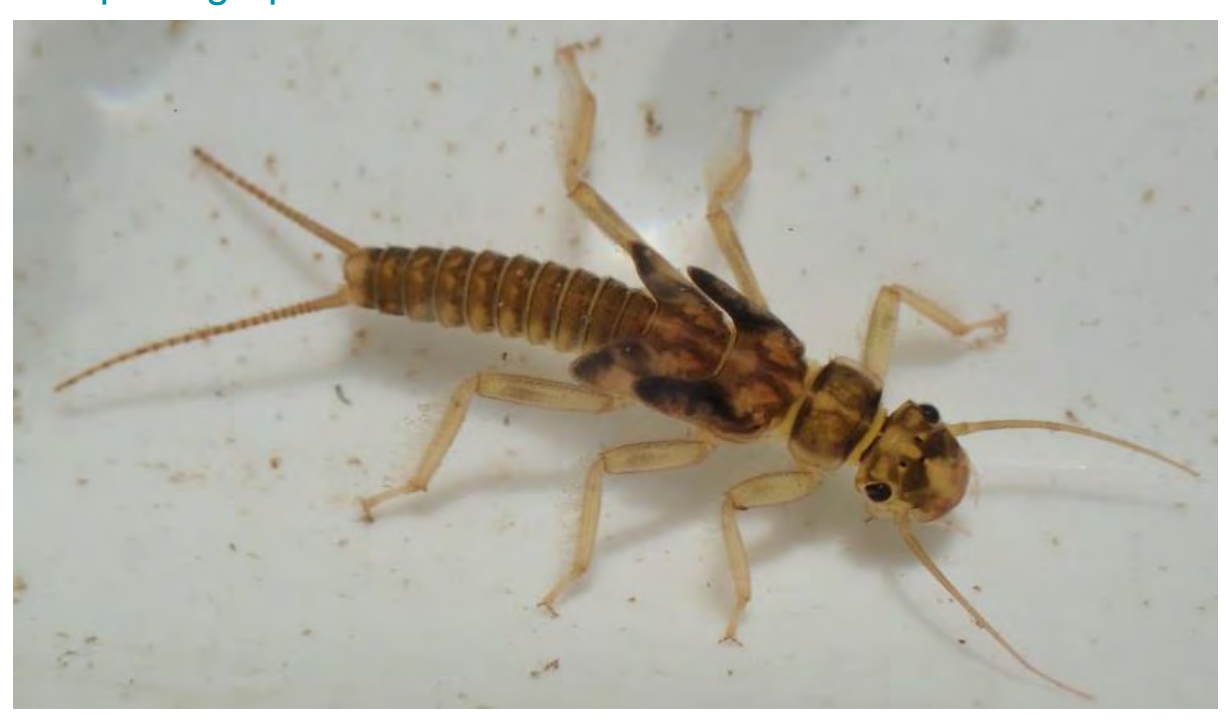
Figure 4. Isogenus nubecula nymph from the River Dee in spring 2018.